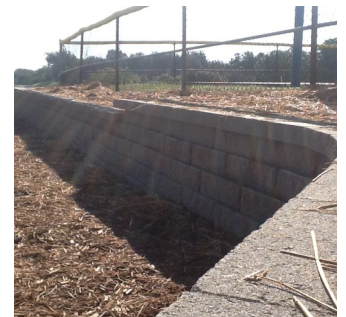
Picture of the new retaining wall that surrounds the playground. The work was completed in 5 school days by Bloomfield Road Lawn and Landscape.