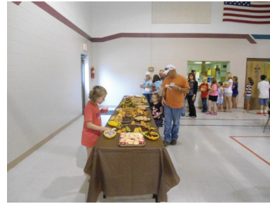
Grandparents and students help themselves to delicious snacks during Bingo.